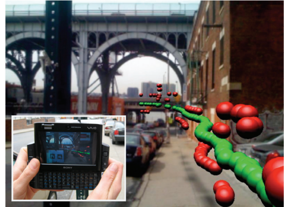
Figure 1. Example situated visualization of carbon monoxide (CO) data. Altitude of spheres represents CO ppm level. Position of spheres represent location of sensor during data acquisition.